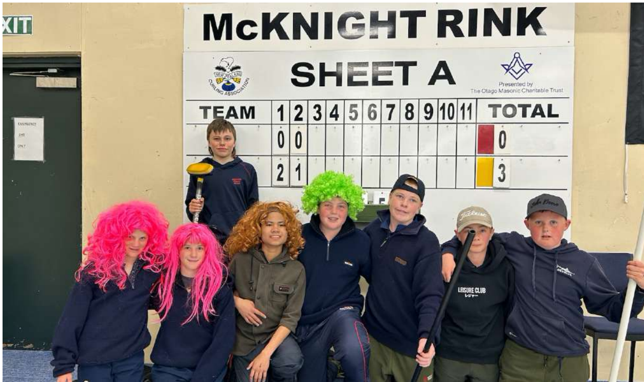
The two St John's teams fought it out for 1st and 2nd placing.